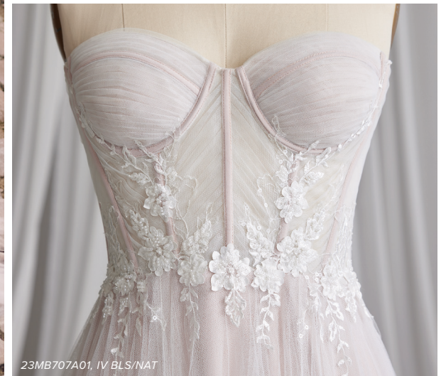
23MB707A01, IV BLS/NAT