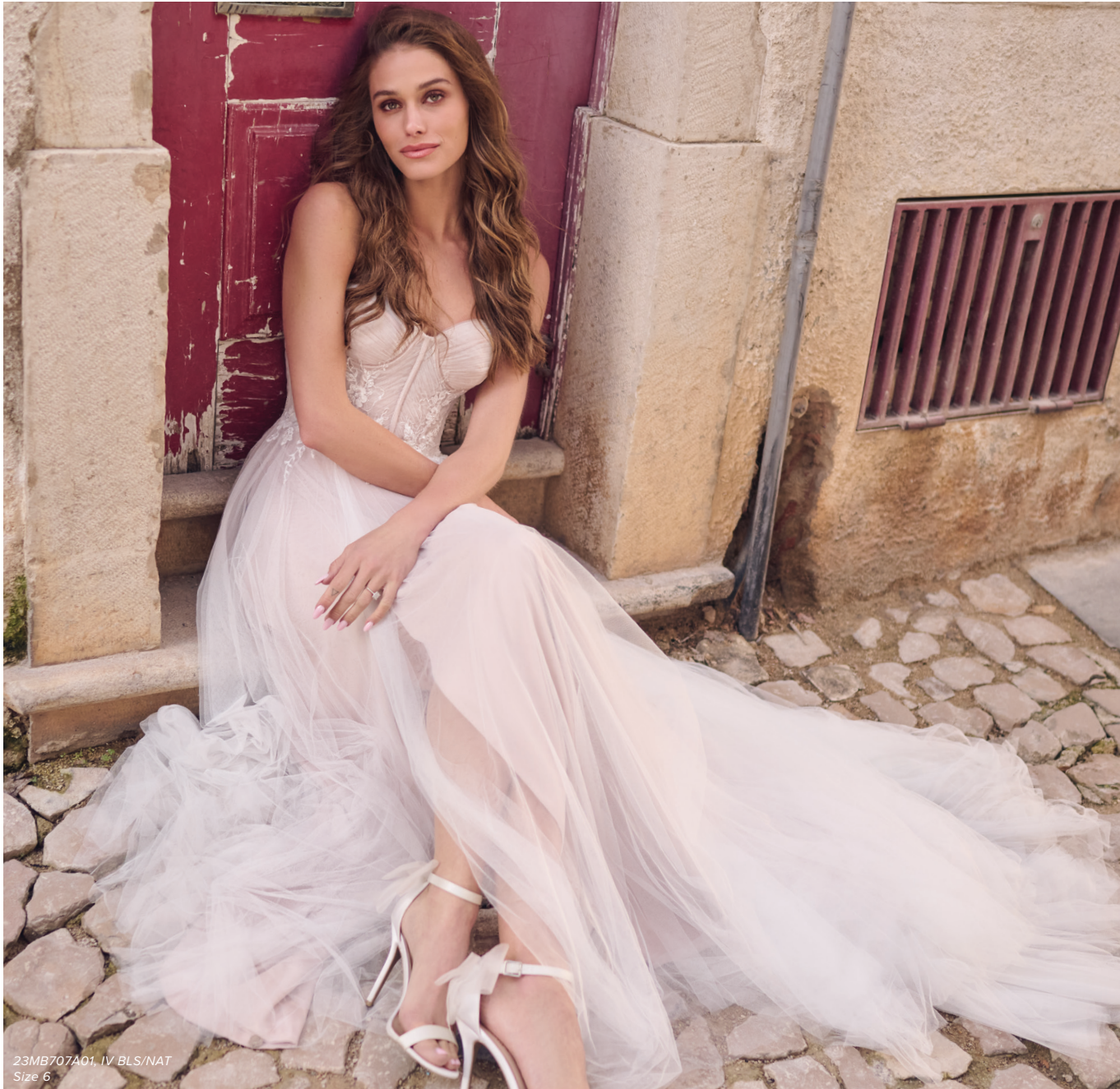
23MB707A01, IV BLS/NAT Size 6