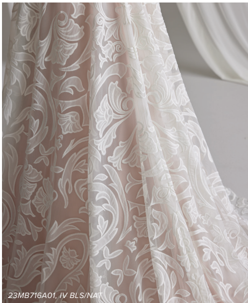
23MB716A01, IV BLS/NAT