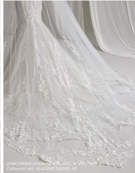
22MC516B01 (Frederique Royale), IV VMV/NAT Cathedral veil: VLA22MC516000, VL