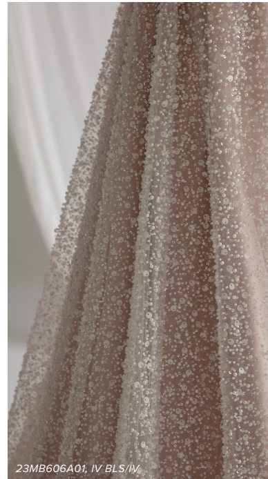
23MB606A01, IV BLS/IV