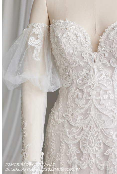
22MC516A01, IV VMV/NAT Detachable sleeves: DS022MC516000, IV