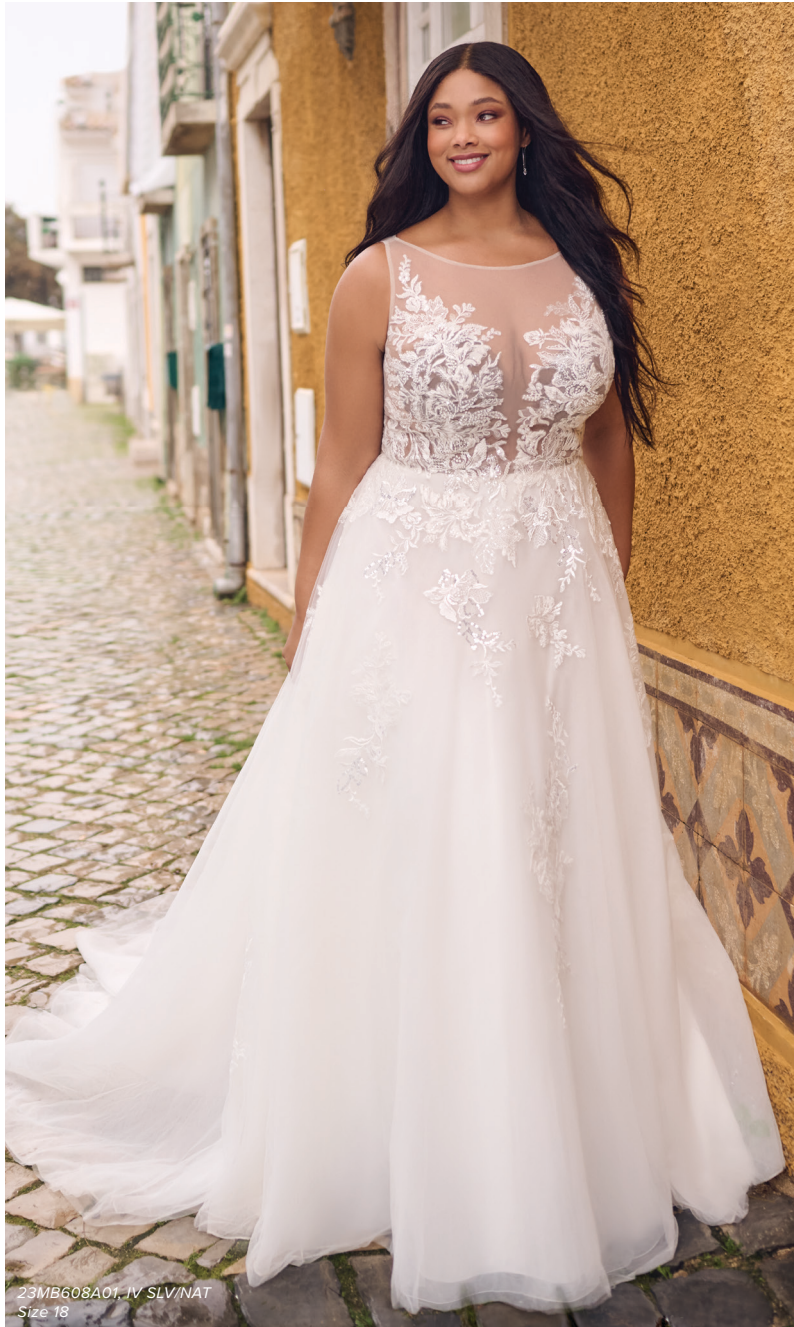
23MB608A01, IV SLV/NAT Size 18