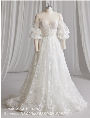
23MK665A01, IV/IV Sleeves: DS023MK665000, IV/IV