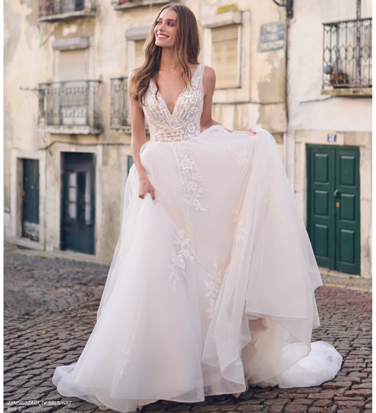
23MN602A01, IV SBLS/NAT Size 6