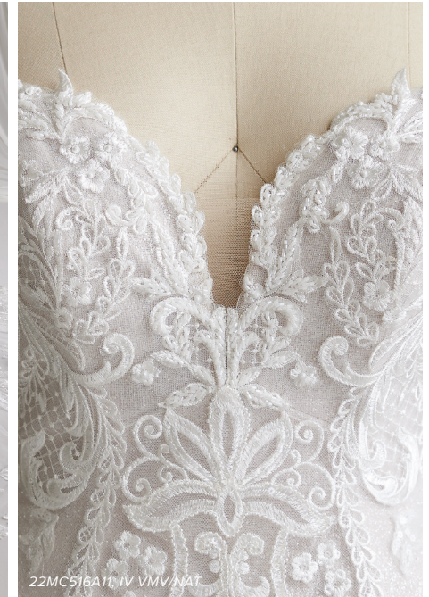
22MC516A11, IV VMV/NAT