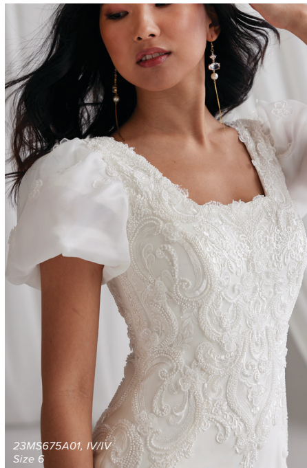
23MS675A01, IV/IV Size 6