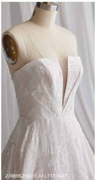
23MB625A01, IV LTTE/NAT