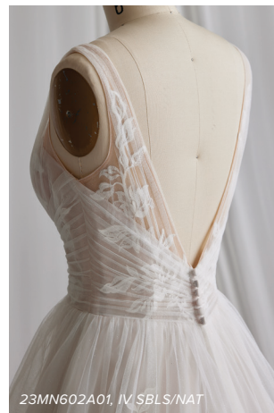
23MN602A01, IV SBLS/NAT