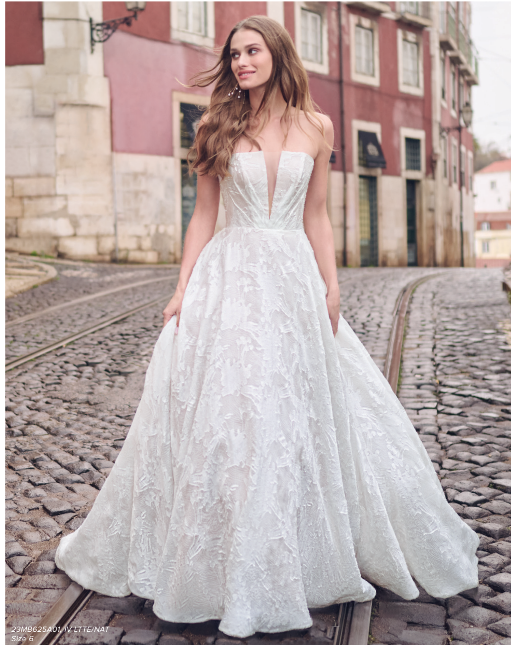
23MB625A01, IV LTTE/NAT Size 6