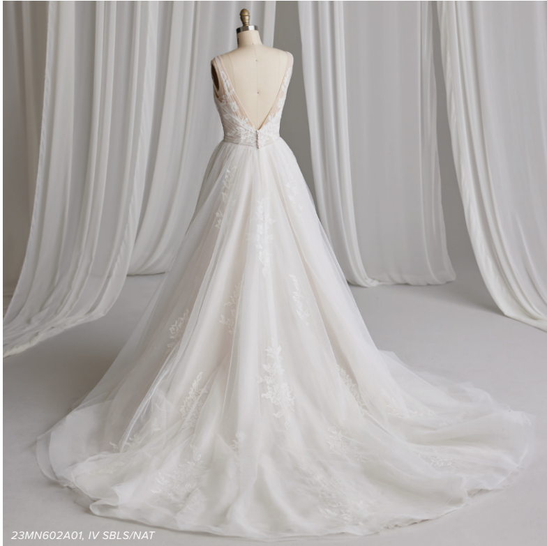
23MN602A01, IV SBLS/NAT