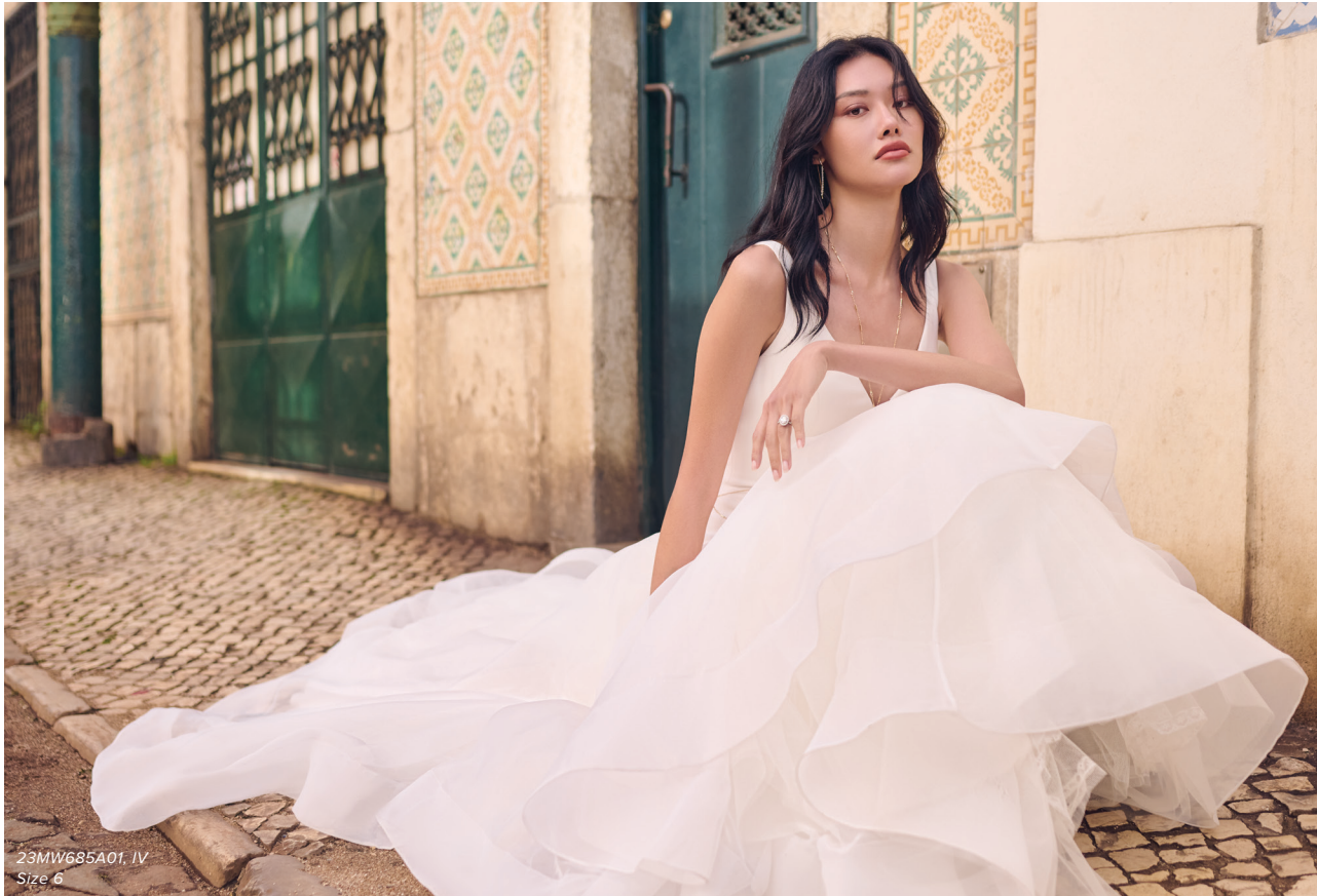
23MW685A01, IV Size 6