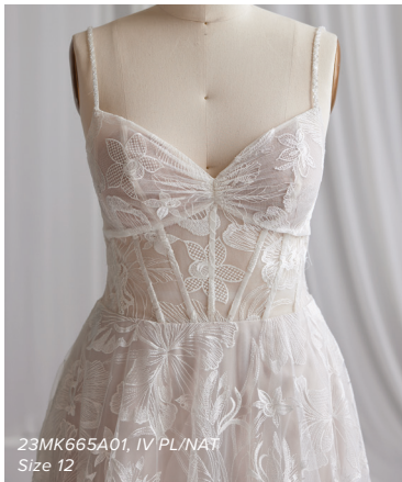
23MK665A01, IV/PL/NAF Size 12