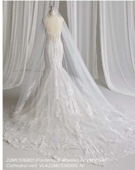
22MC516B01 (Frederique Royale), IV VMV/NAT Cathedral veil: VLA22MC516000, IV