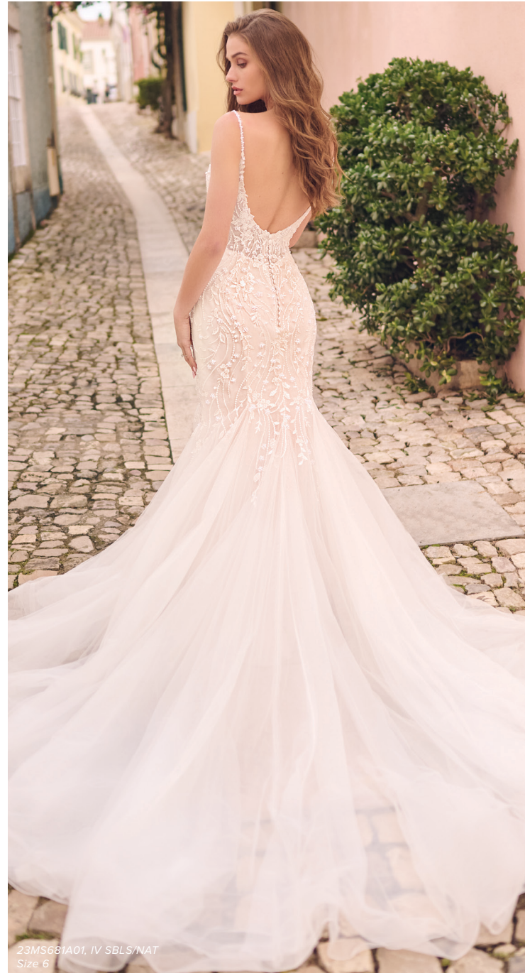
23MS681A01, IV SBLS/NAT Size 6