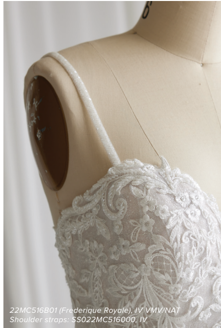
22MC516B01 (Frederique Royale), IV VMV/NAT Shoulder straps: SS022MC516000, IV