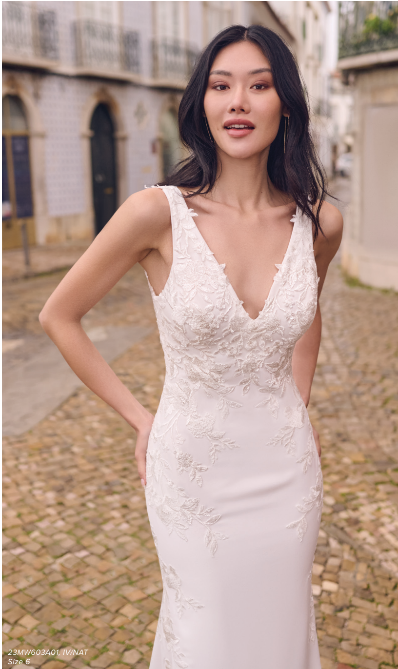
23MW603A01, IV/NAT Size 6