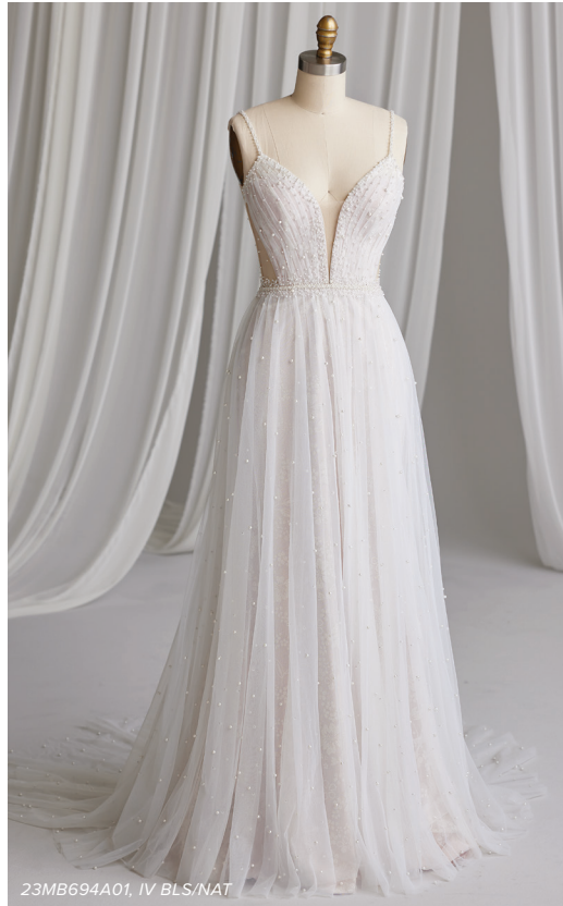
23MB694A01, IV BLS/NAT