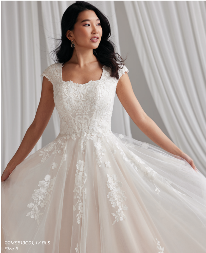
22MS513C01, IV BLS Size 6