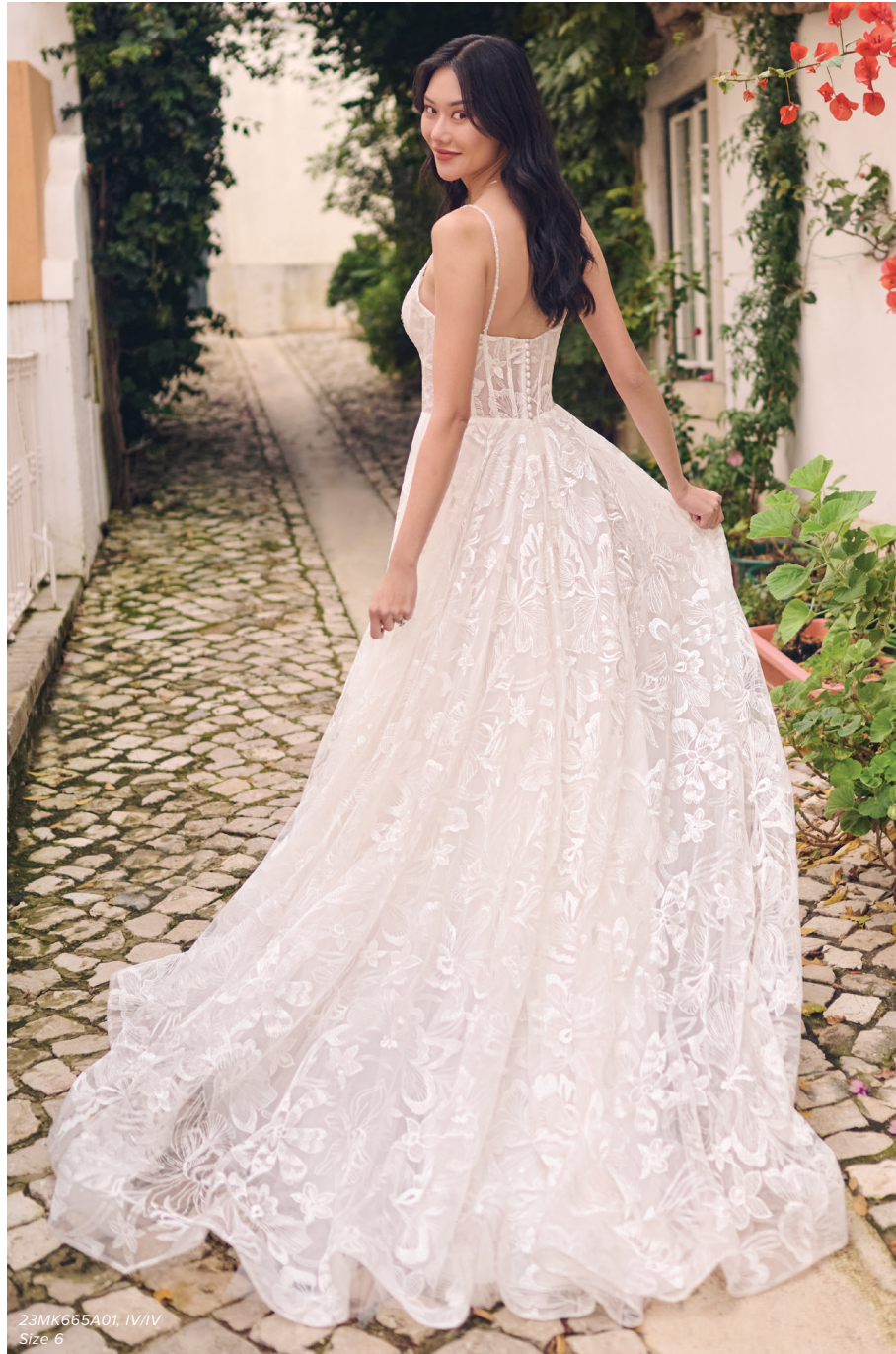
23MK665A01, IV/IV Size 6