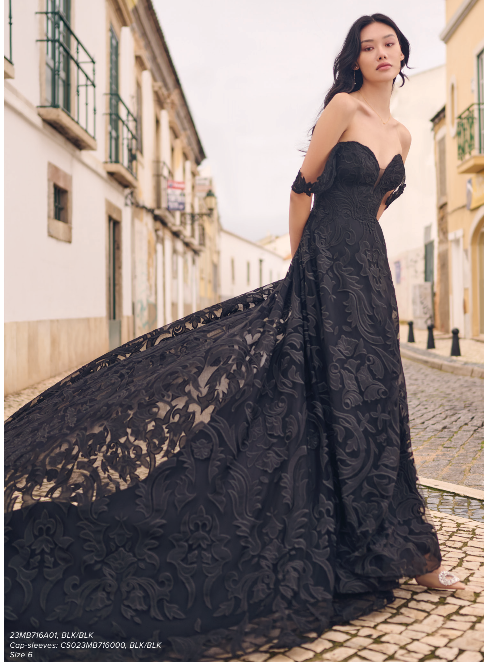
23MB716A01, BLK/BLK Cap-sleeves: CS023MB716000, BLK/BLK Size 6