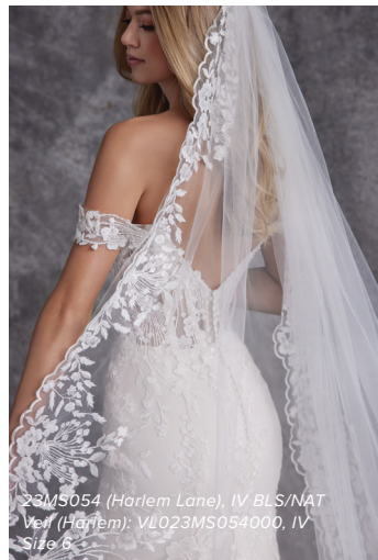
23MS054 (Harlem Lane), IV BLS/NAT Veil (Harlem): VL023MS054000, IV Size 6