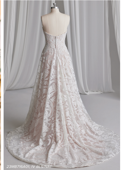
23MB716A01, IV BLS/NAT