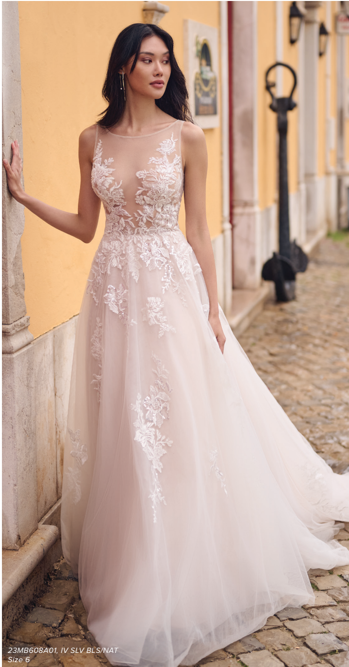
23MB608A01, IV SLV BLS/NAT Size 6