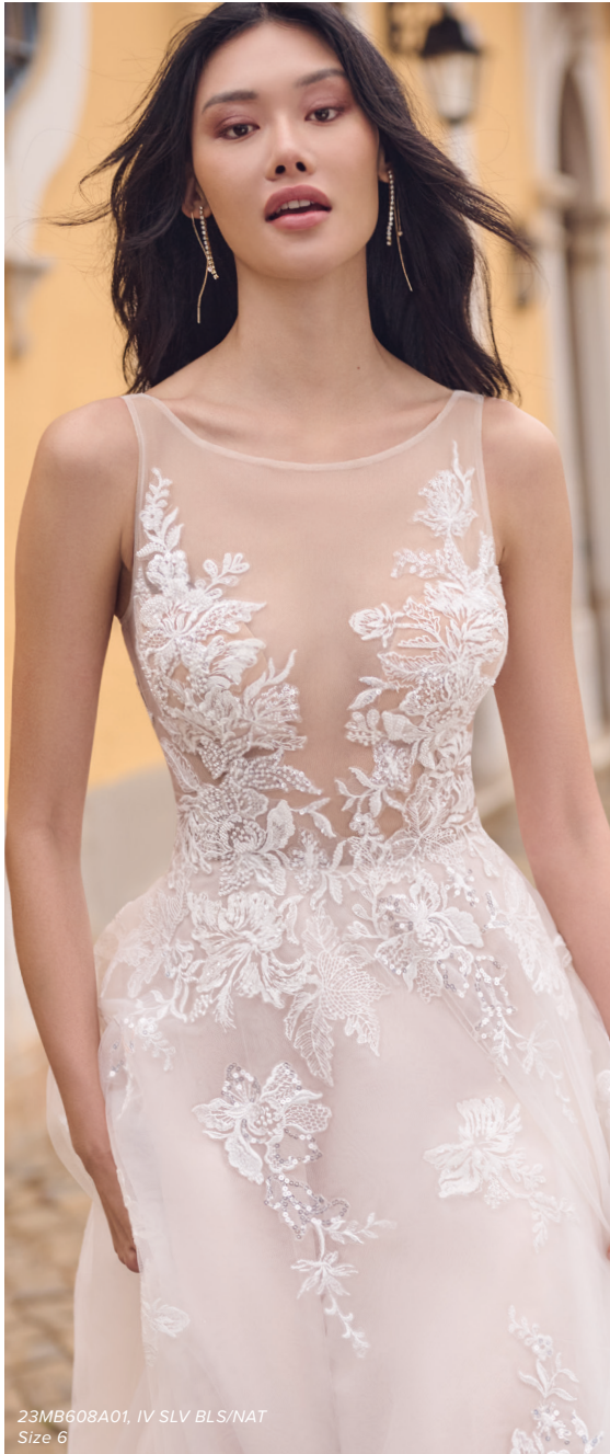
23MB608A01, IV SLV BLS/NAT Size 6