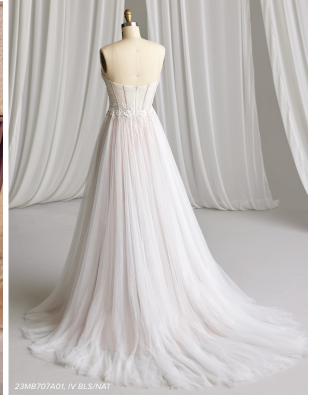
23MB707A01, IV BLS/NAT