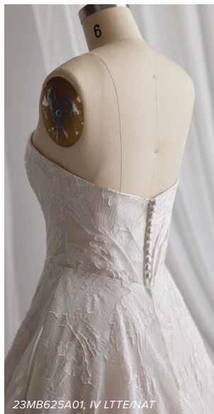
23MB625A01, IV LTTE/NAT