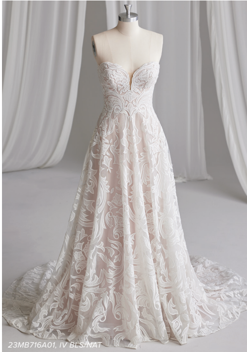
23MB716A01, IV BLS/NAT