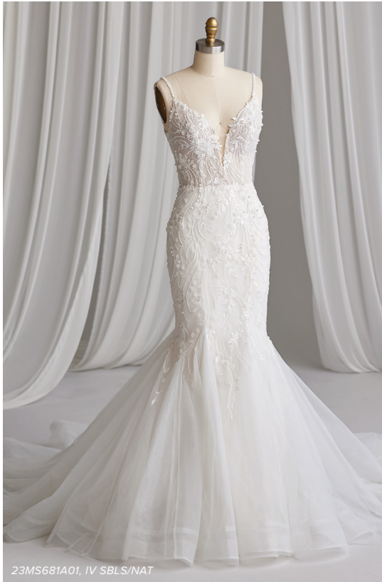
23MS681A01, IV SBLS/NAT