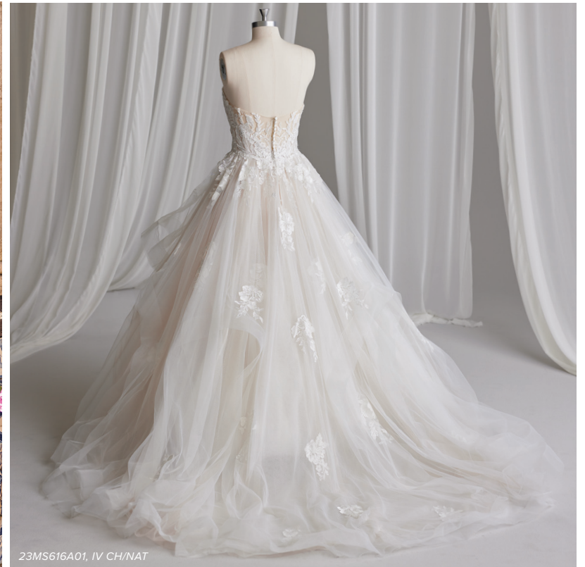
23MS616A01, IV CH/NAT