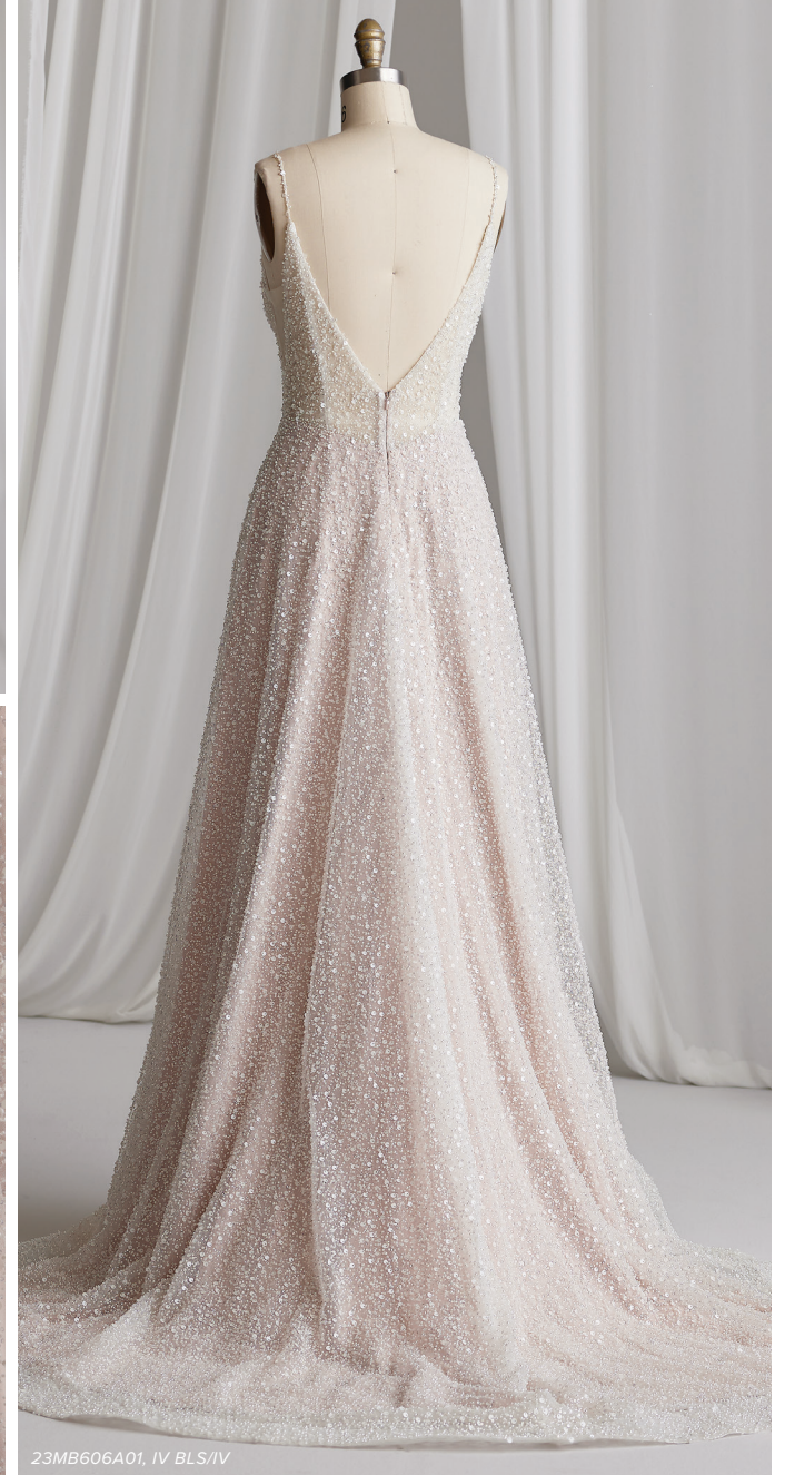
23MB606A01, IV BLS/IV