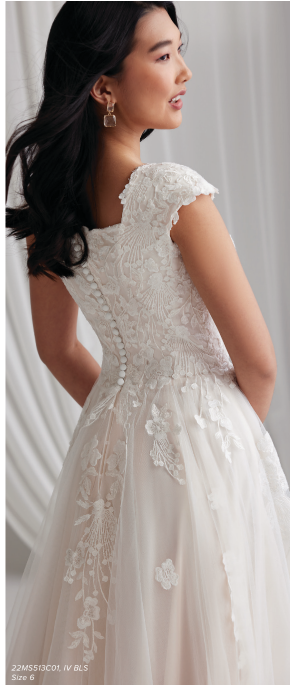
22MS513C01, IV BLS Size 6