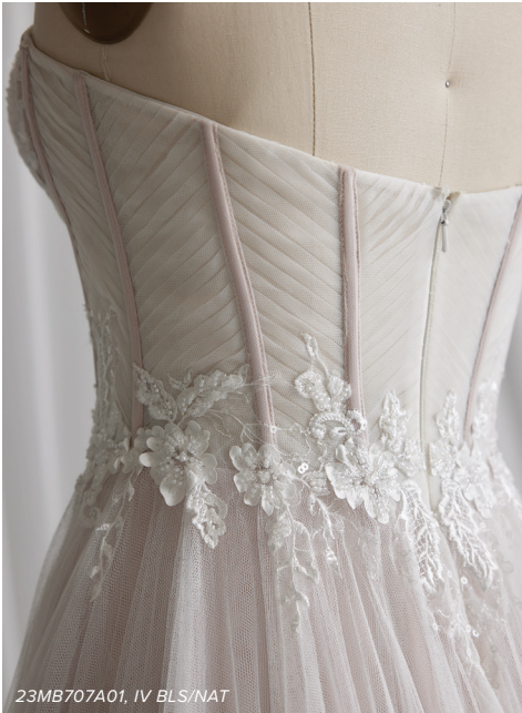
23MB707A01, IV BLS/NAT