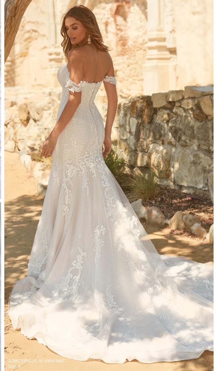
22MC516A01, IV VMV/NAT Size 6