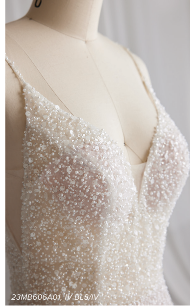
23MB606A01, IV BLS/IV