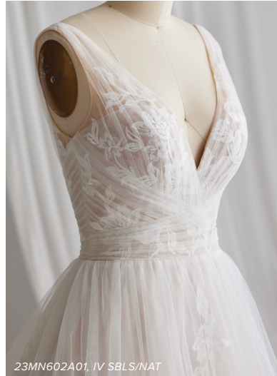
23MN602A01, IV SBLS/NAT