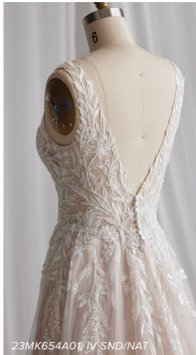
23MK654A01, IV SND/NAT