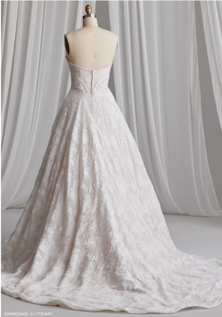
23MB625A01, IV LTTE/NAT