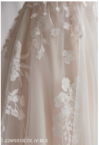
22MS513C01, IV BLS