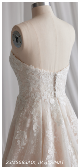
23MS683A01, IV BLS/NAT