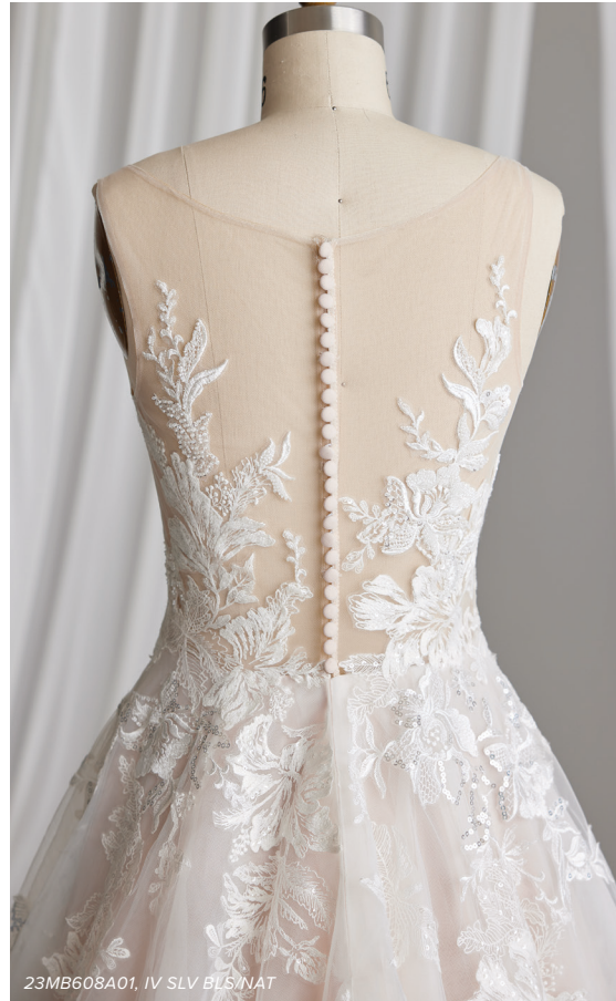
23MB608A01, IV SLV BLS/NAT