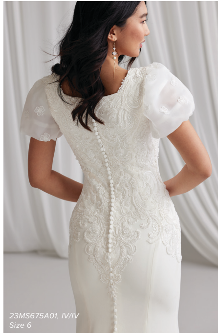
23MS675A01, IV/IV Size 6