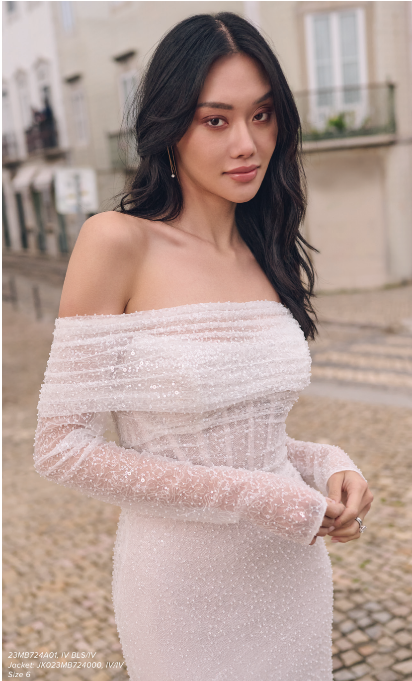
23MB724A01, IV BLS/IV Jacket: JK023MB724000, IV/IV Size 6