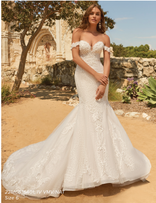
22MC516A01, IV VMV/NAT Size 6

MID-SEASON DROP: NEW! styles & personalization