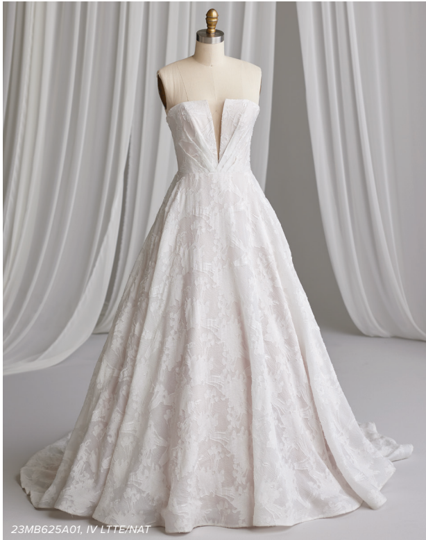
23MB625A01, IV LTTE/NAT