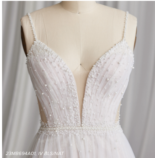
23MB694A01, IV BLS/NAT