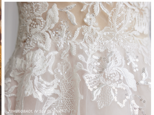
23MB608A01, IV SLV BLS/NAT