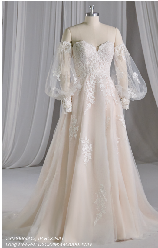
23MS683A12, IV BLS/NAT Long sleeves: DSC23MS683000, IV/IV