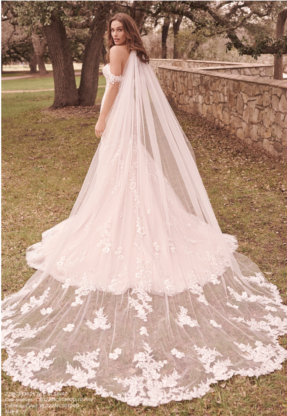
22MC913A01, IV P BLS/NAT Cap-sleeves: CS022MC913000, IV P/IV Cathedral veil: VL022MC913000 Size 6