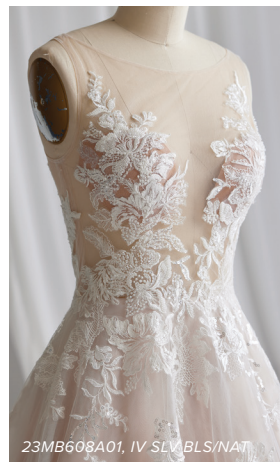
23MB608A01, IV SLV BLS/NAT