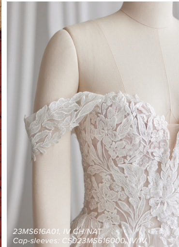
23MS616A01, IV CH/NAT Cap-sleeves: CS023MS616Q00, IV/IV