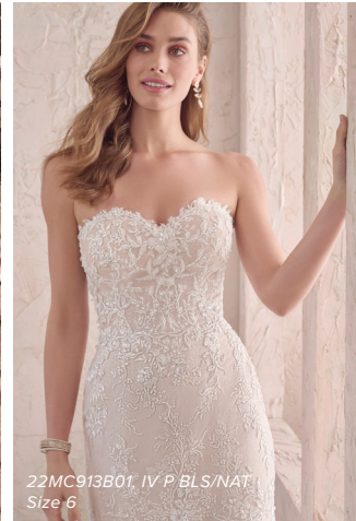
22MC913B01, IV P BLS/NAT Size 6