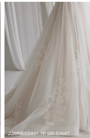
23MN602A01, IV SBLS/NAT