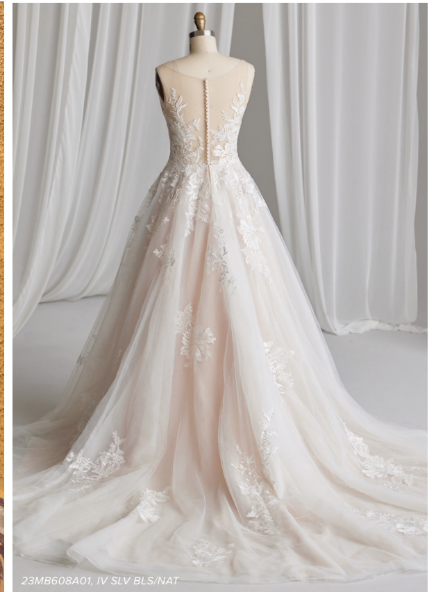
23MB608A01, IV SLV BLS/NAT