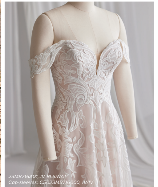
23MB716A01, IV BLS/NAT Cap-sleeves: CS023MB716000, IV/IV