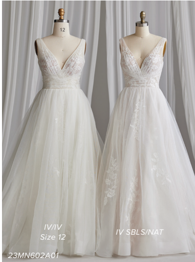
IV/IV Size 12 23MN602A01