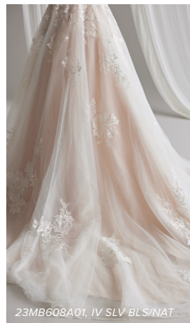
23MB608A01, IV SLV BLS/NAT