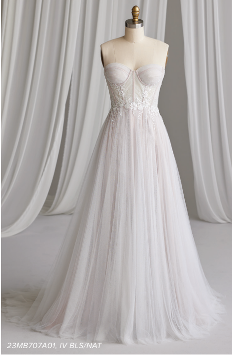
23MB707A01, IV BLS/NAT