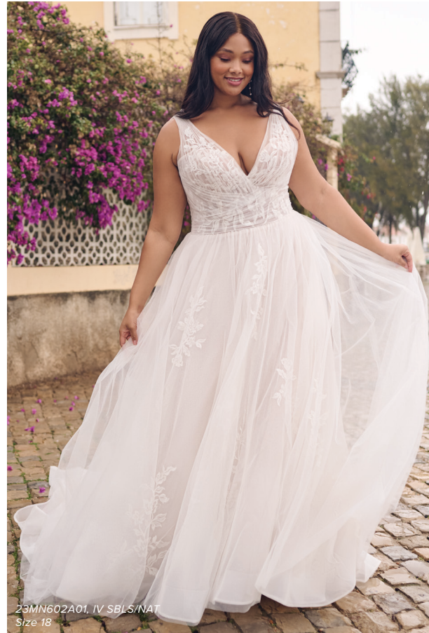
23MN602A01, IV SBLS/NAT Size 18