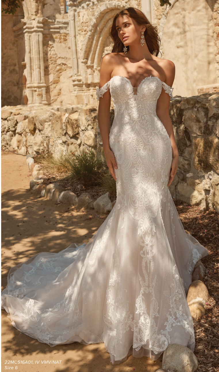
22MC516A01, IV VMV/NAT Size 6